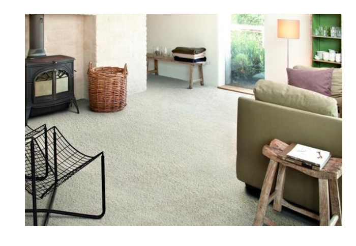
https://www.balta-carpets.com/en/Products/ Balta carpets/Collections/Woolmaster by balta/